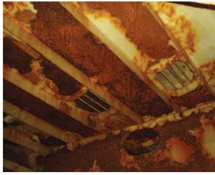
Poor tank condition

Another question is how to run such tests? A factor that may influence the effect on coatings is a ship's trading pattern. Some ships ballast at least once a week while others go for months without any change in ballast. Ships that regularly take on ballast