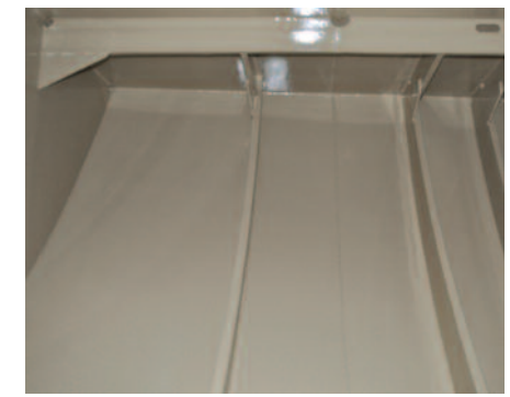
Good tank condition

could put the tank coatings at greater risk once a treatment system is installed, as any oxidising agents are replenished each time ballast is taken on. Any testing should therefore replenish treated water regularly to test the worst-case scenario and mimic conditions in a ballast tank which the coating test for PSPC approval testing was designed to do.